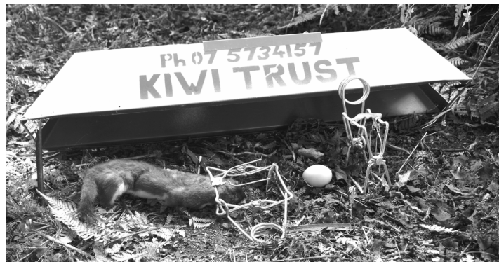
Stoat caught in a Conibear trap baited with an egg

The Otago Kiwi Trust volunteers carry out stoat and ferret control on a year round basis using double set kill traps (see photo below). Traps are checked and re-baited every 2 weeks in summer and every 4 weeks during winter.