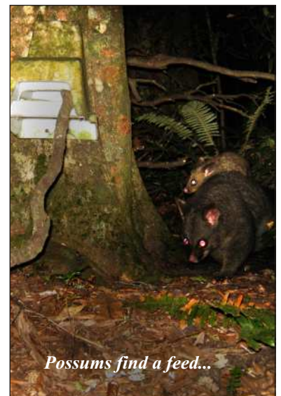
Possums find a feed...