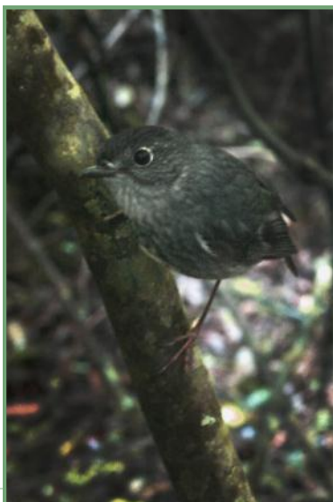
2 North Is Robin spotted on the rimu walk

Do send us your photos—flora, fauna and tramps, we love to see people enjoying our special forest.