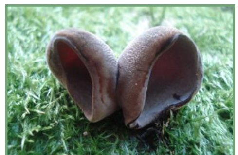
Fungi spotted by Pyes Pa School Kids