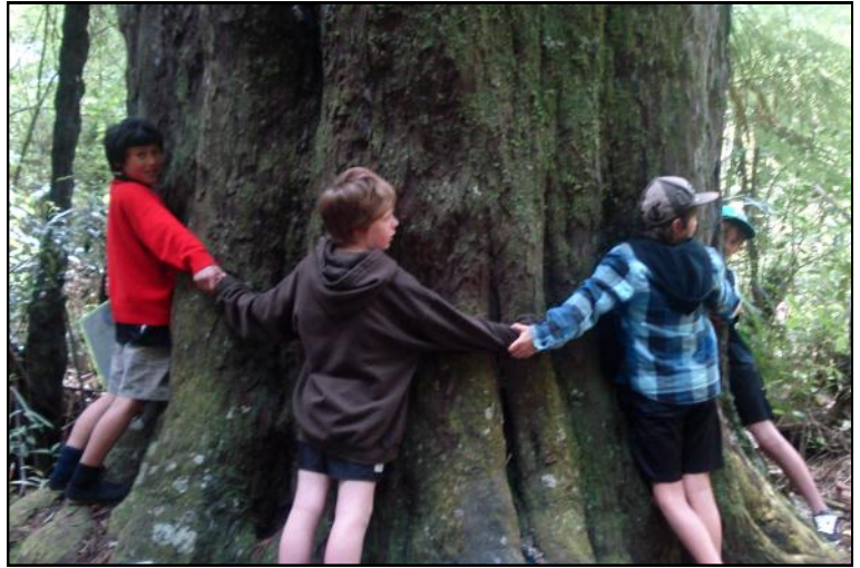
Pyes Pa School children measure the giant rimu.

Thanks also to these groups for your generous donations: Port of Tauranga, Pyes Pa School, Te Puke Primary School, Oropi Rural Women, Harmer Parr, Whangamata Vintage Club, Whangamata Ramblers, Oropi Ladies Social Club, Arbor Care Ltd, Comvita, Te Puke Kiwi Coast Lions and KPMG Social Club.