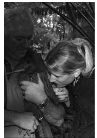
Kiwi Release 14 March 2007